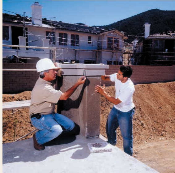
From the time product leaves the plant until the project is completed, LaHabra Stucco is your partner on the job.

When you do business with LaHabra, you get more than just a great product – you get on-site assistance from industry specialists who work with you every step of the way.